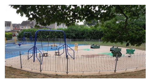
St Francis Grove Play Area

Laceby Village Council is responsible for: