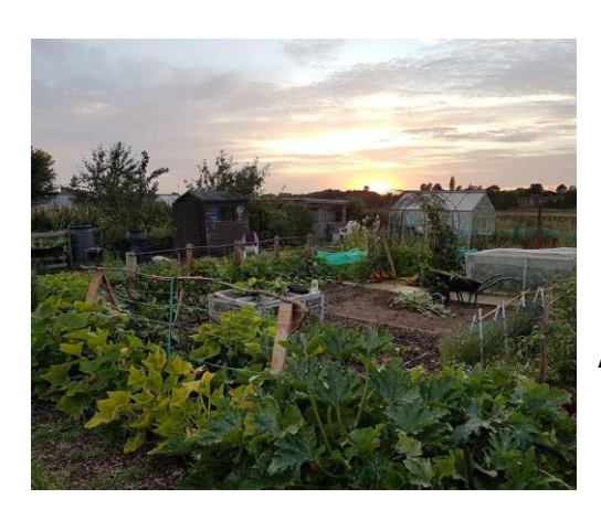
Allotments on Butt Lane (plot 16)